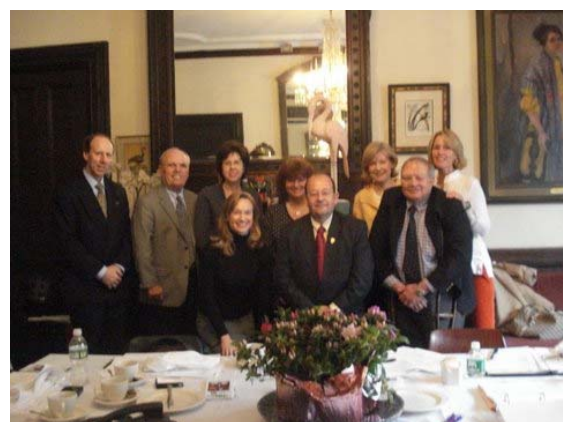
Group photo from the meeting