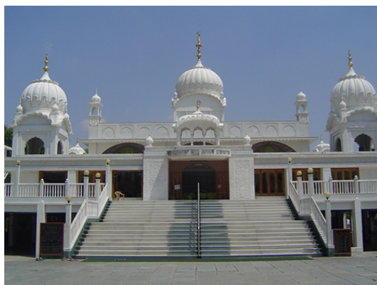
The Guru Nanak Darbar (a Sikh palace in Pune)